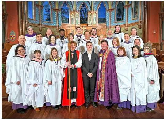
A Festival of Nine Lessons & Carols Sunday, December 15 at 4:00 PM

Hospitality Committee - Please considerer contributing a snack of your choice for Coffee Hour every now and then. Suggestions include cookies, cheese and crackers or a small cake. Items that can be frozen are especially helpful to enable the size of the spread to match the size of the crowd.