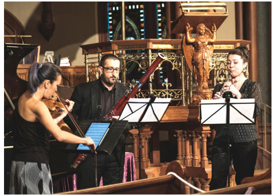
Lyrica Baroque in Concert Thursday, December 19 at 7:00 PM

Watch the Sunday 10:00 Eucharist webcast