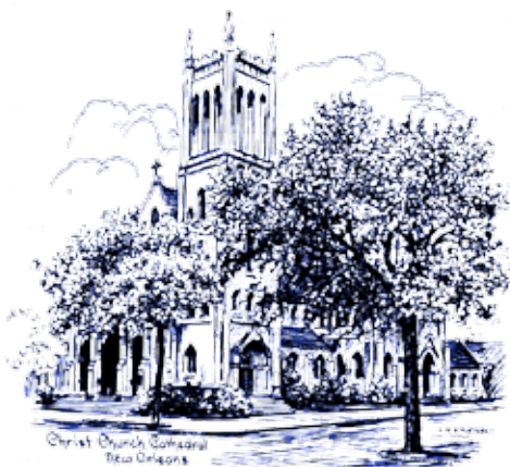
Christ Church Cathedral New Orleans

Online streaming and downloadable podcast at www.wgso.com Broadcasts underwritten in part by St. Martin's Episcopal School.