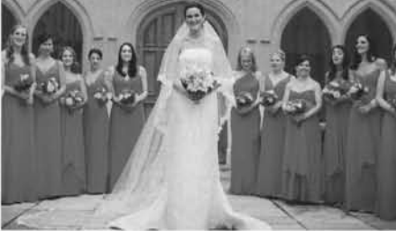
The bridesmaids, in Badgley Mischka, and the bride, in Carolina Herrera, outside the church