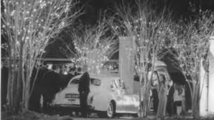
The great escape