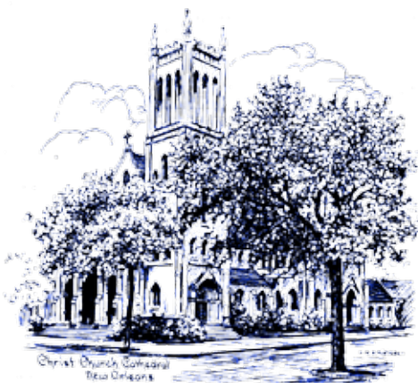
Christ Church Cathedral New Orleans

Online streaming and downloadable podcast at www.wgso.com Broadcasts underwritten in part by St. Martin's Episcopal School.