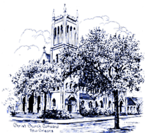
Christ Church Cathedral New Orleans

Online streaming and downloadable podcast at www.wgso.com Broadcasts underwritten in part by St. Martin's Episcopal School.