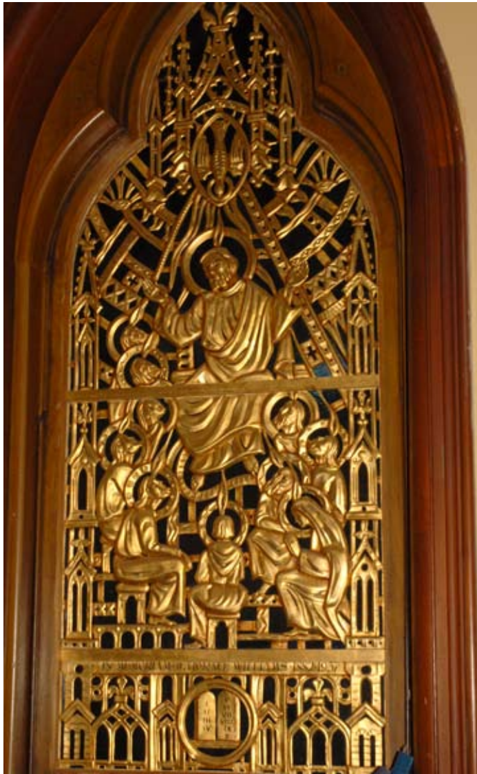
- Pentecost window Do you know where it's located?

Don't Forget to Wear Something Red on Pentecost Sunday May 19!