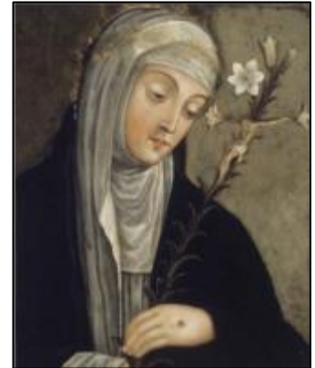
"St. Catherine of Siena" c. 1500-1699, oil on copper. Brooklyn Museum, New York.

Born in 1347, Caterina Benincasa was the youngest of 25 children born to a wealthy cloth dyer of Siena. According to Holy Women, Holy Men (Church Publishing, 2010), at six years old, she had a vision that would determine her life's work. While walking along a road to her home, she looked upward and "beheld our Lord seated in glory with St. Peter, St. Paul, and St. John." In this vision, she would later report, Jesus blessed her.