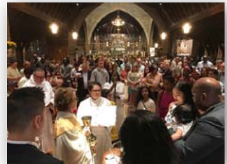
Christ Church, Bloomfield & Glen Ridge, NJ, Diocese of Newark. Celebrating a baptism.