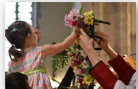
St. Paul's Episcopal Church, Duluth, Episcopal Church in Minnesota. Flowering the cross.