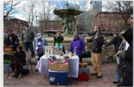
Church Beyond the Walls, Providence, Diocese of Rhode Island. Censuring the altar during the Eucharist.

Almighty God, who through your only-begotten Son Jesus Christ overcame death and opened to us the gate of everlasting life: Grant that we, who celebrate with joy the day of the Lord’s resurrection, may be raised from the death of sin by your life-giving Spirit; through Jesus Christ our Lord, who lives and reigns with you and the Holy Spirit, one God, now and forever. Amen.