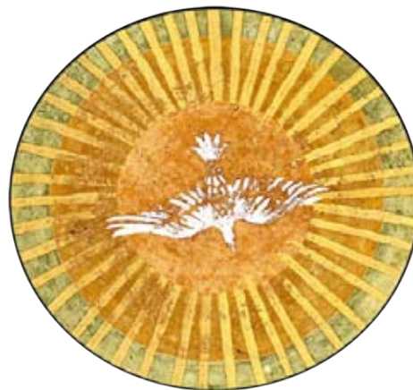
Detail from 13th-century fresco above baptismal font, Zica monastery, near Kraljevo, Serbia.

“Then Jesus came from Galilee to John at the Jordan, to be baptized by him. John would have prevented him, saying, ‘I need to be baptized by you, and do you come to me?’ But Jesus answered him, ‘Let it be so now; for it is proper for us in this way to fulfill all righteousness.’ Then he consented. And when Jesus had been baptized, just as he came up from the water, suddenly the heavens were opened to him and he saw the Spirit of God descending like a dove and alighting on him. And a voice from heaven said, ‘This is my Son, the Beloved, with whom I am well pleased’” (Matthew 3:13-17).